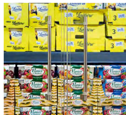
Slim handles emphasise the crystal clear look