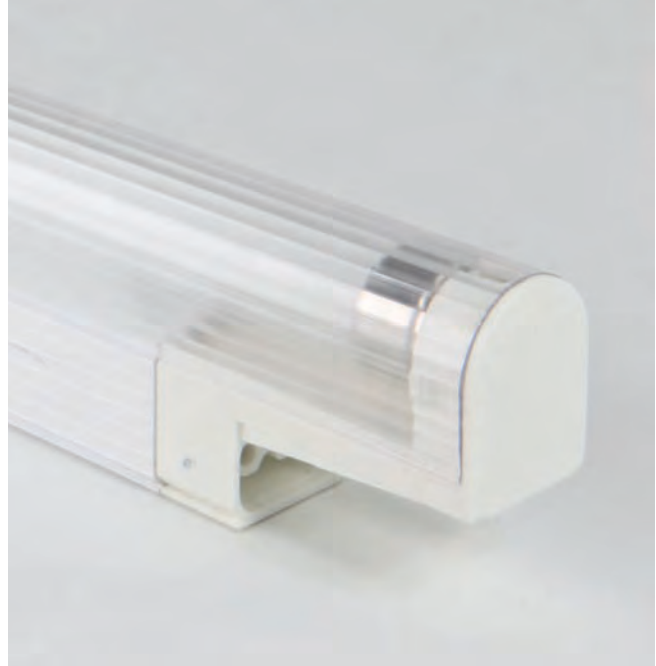
Fluorescent tube lighting