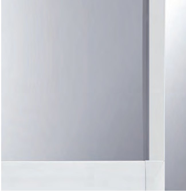
Extra wide display area