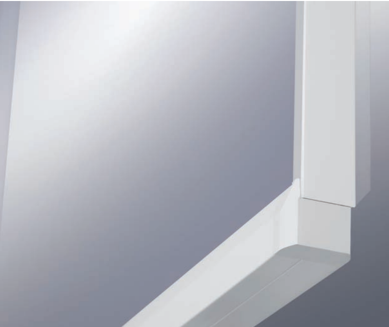
Slim edge protection protects the glass and increases visibility