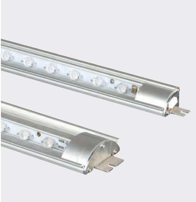
Several LED lighting options