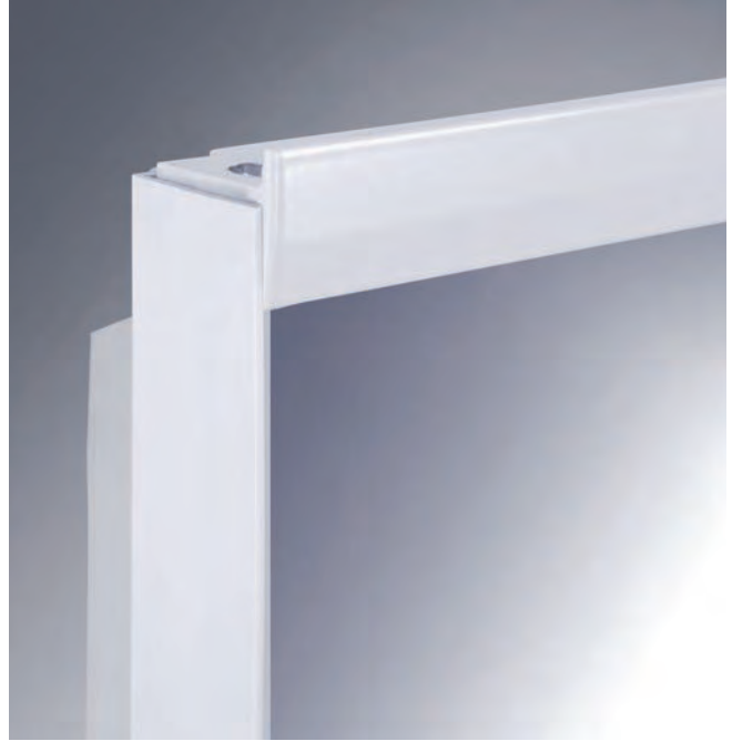
Upper and lower profile in light grey