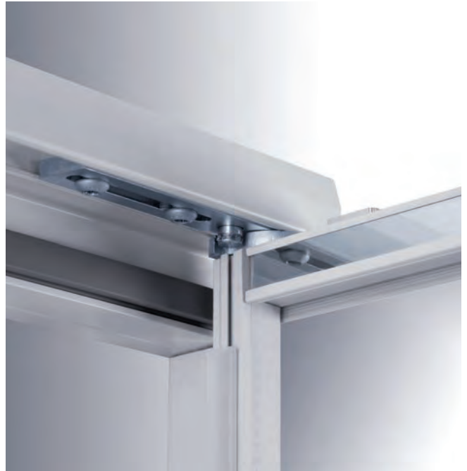
A door stop function regulates door opening